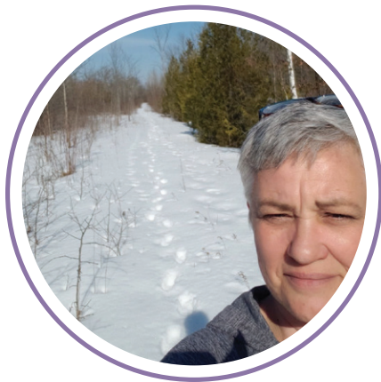
Dallas // Property Crew

Since this is our first edition of this newsletter, we decided to introduce you to a few of our awesome team members.